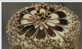
Chocolate Symphony Cake

Layers of chocolate devil's food cake and layers of rich cream cheese frosting. Garnished with chocolate shavings and a swirled chocolate-cream cheese.