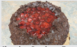
Chocolate Raspberry Torte

Devil's food cake filled with chocolate mousse, raspberries, raspberry jam and whipped cream. Sculpted with chocolate shavings.