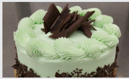
Creme De Menthe Cake

Devil's food cake layered and finished with mint-flavored mousse. Garnished with chocolate shavings