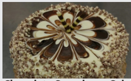
Chocolate Symphony Cake

Layers of chocolate devil's food cake and layers of rich cream cheese frosting. Garnished with chocolate shavings and a swirled chocolate-cream cheese.