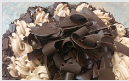
Bailey's Irish Cream Torte

Three layers of chocolate devil's food cake with two layers of Bailey's mousse garnished with mousse and chocolate shavings.