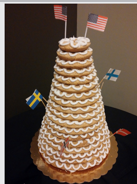
Kransekake - 9 Ring Cake $90

A 9-tiered Scandinavian holiday treat. You can choose from two different decorations: White Fondant Balls or Daisies. This tasty treat is made from almond paste, sugar, egg white and icing.